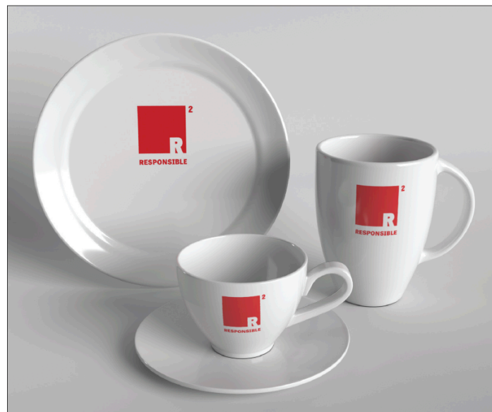
Adobe Dimension CC: 11 min. 53 sec.