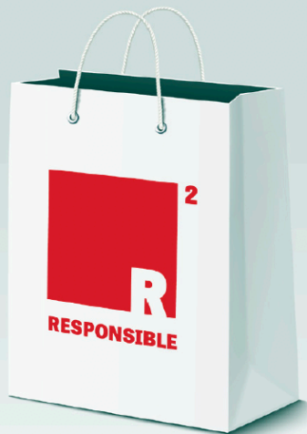
Adapting stock vector template: 13 min. 58 sec.