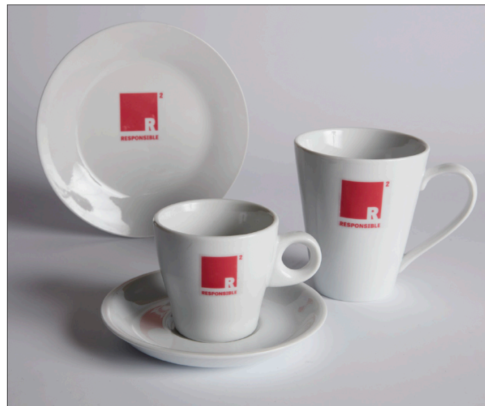
Studio Shoot: 44 min. 29 sec.