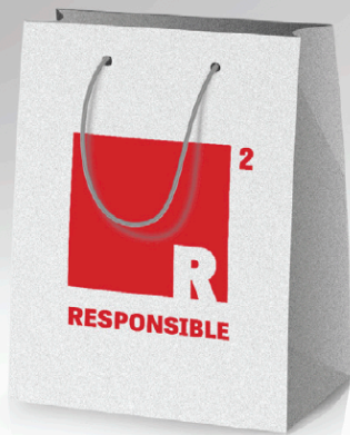
Compositing with stock image: 28 min. 56 sec.