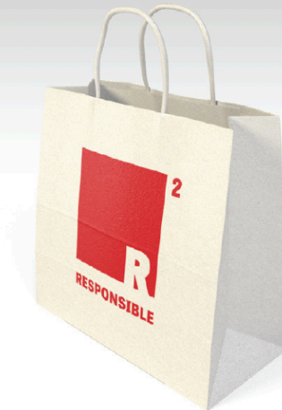
Adobe Dimension CC: 2 min. 7 sec.