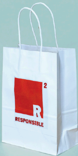
Make paper mock-up: 28 min. 34 sec.