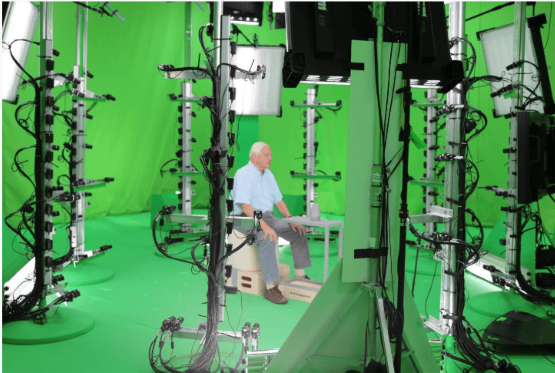
Microsoft's Seattle Volcap