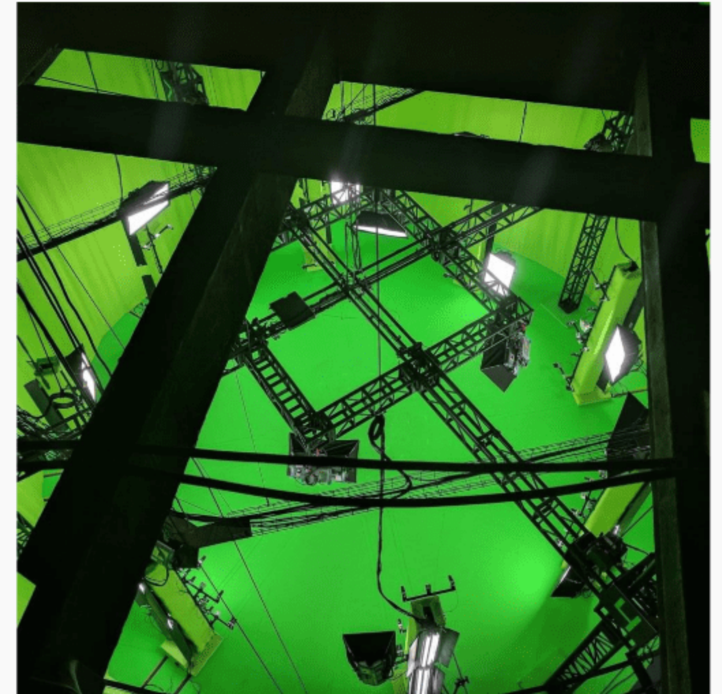
Microsoft's Metastage Volcap