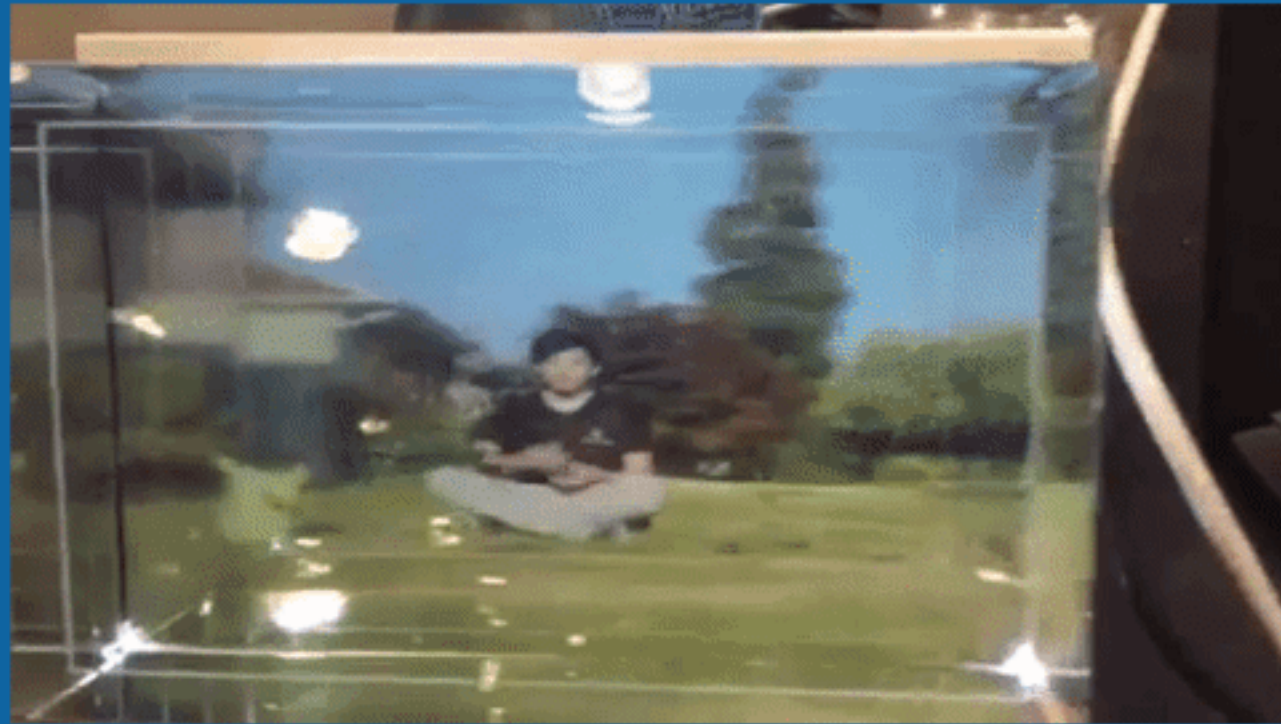
Looking Glass Light Field Display