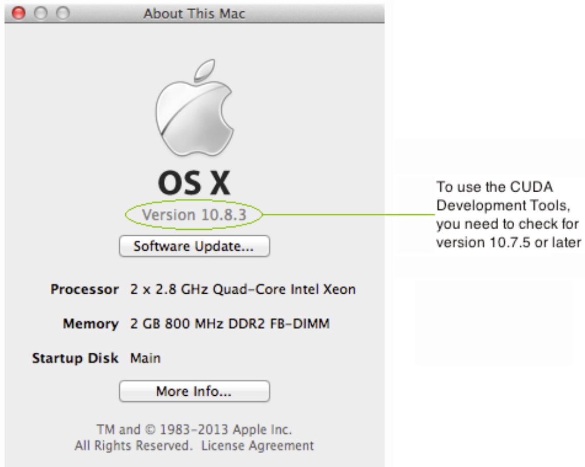
Figure 1 About This Mac Dialog Box