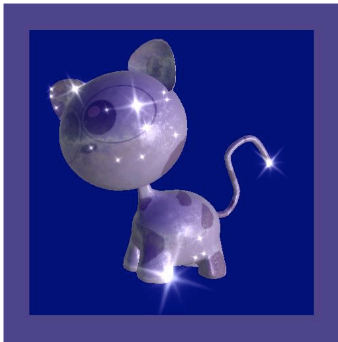
Figure 1. Sample Screen Capture