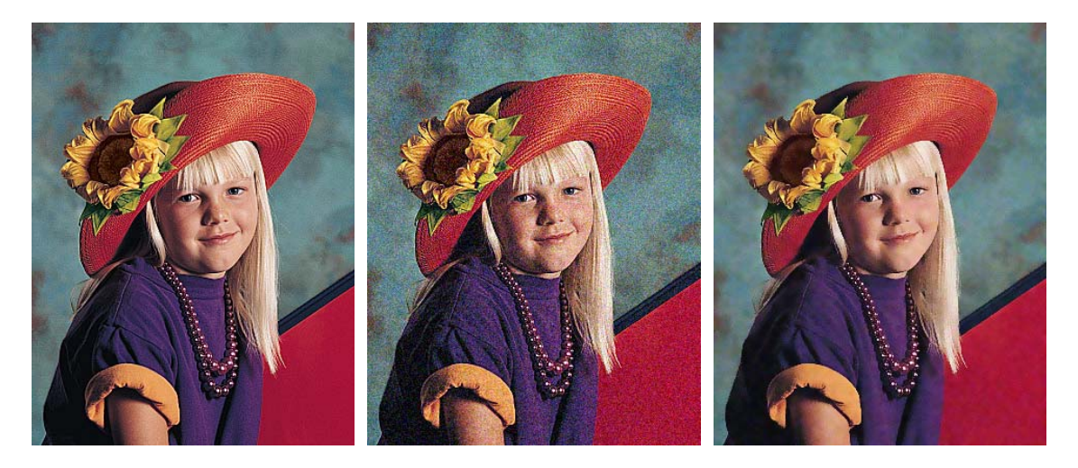
Figure 1. Original, Noisy and KNN Restored Picture