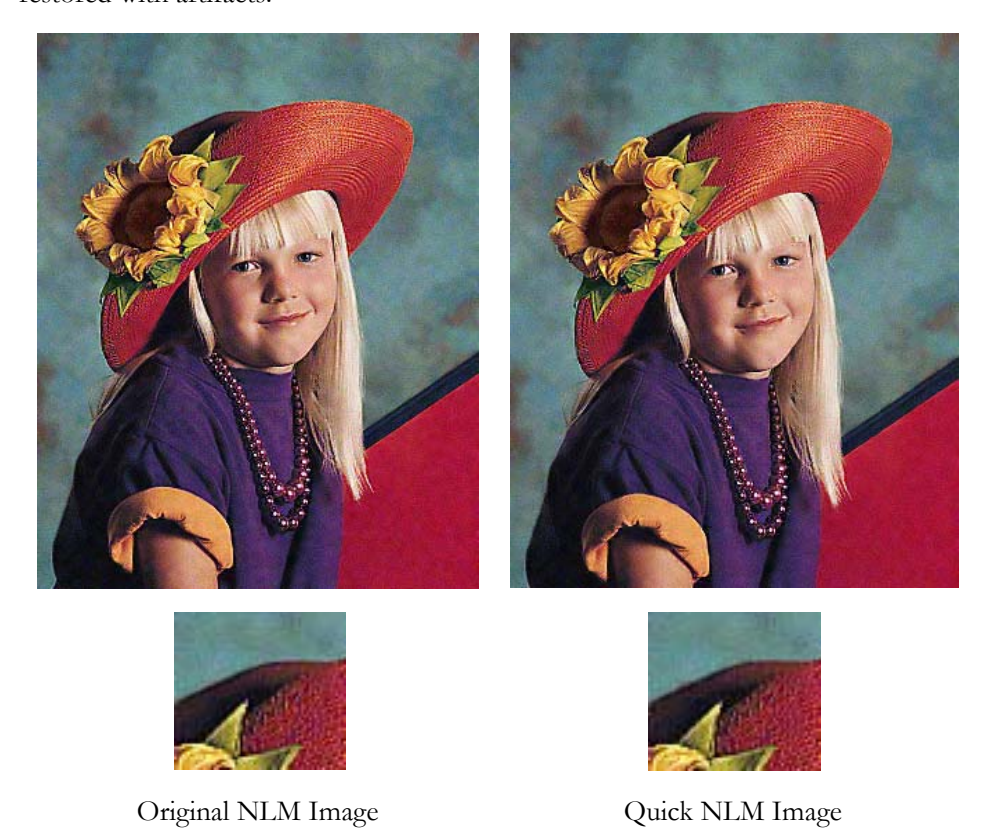
Figure 5. Difference between NLM and quick NLM method.

The assumption that weights are uniform within a block is fairly true. Most smooth areas are restored with no visual difference from original NLM. However areas with edges can be restored with artifacts.