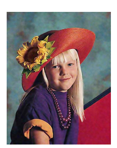
Figure 2. Original, Noisy and NLM Restored Picture.

Note: NLM can even fix some flaws in original images (Figure 4)