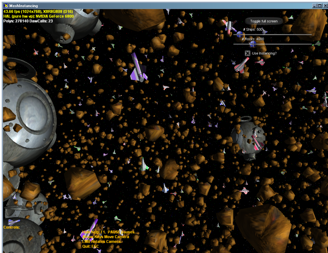
Figure #: Shot of NVSDK Instancing Sample

Now that we've covered all the basics; let's dissect a slightly more complex example. This example was written as a demo for the instancing functionality. As you can see from the screen shot below; it consists of a space scene filled with asteroids and space ships. This sample uses the DX Instancing API as described to reduce the # of draw calls and increase performance.