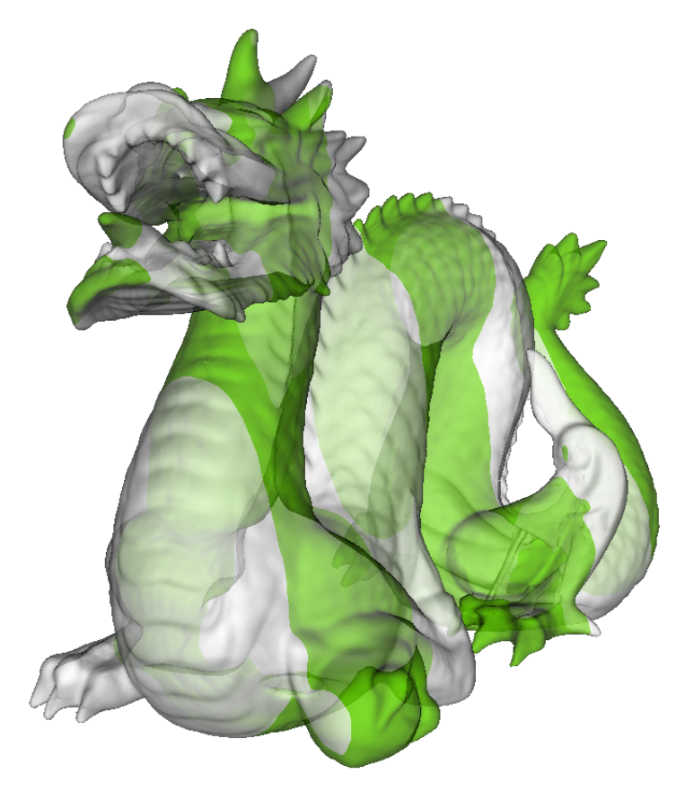
Figure 1. Dual depth peeling peels 4 color layers in 2 geometry passes. Image rendered with alpha=60%.

Rendering semi-transparent surfaces correctly using the alpha blending equation requires sorting fragments from front to back or back to front. Depth peeling is a robust solution to the fragment sorting problem which renders the transparent objects multiple times, peeling one layer of fragments every time. We introduce dual depth peeling, an extension of depth peeling based on a min-max depth buffer which peels two layers at a time, one layer from the front and one from the back. Alpha blending is interleaved with dual depth peeling, using different blend equations for front peeling and back peeling. The algorithm guarantees that no fragments can be blended twice. We implement our min-max depth buffer using 32-bit floating-point blending, which is fast on GeForce 8. We also describe a sort-independent method which replaces the RGBA color in the alpha blending equation by the per-pixel weighted average over the pixel, using alpha values as weights. This approximate method can render plausible order independent transparency with a single geometry pass.